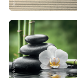
SELF-INVESTED PERSONAL PENSIONS (SIPPS)

The investment option that lets you control how and where your money is invested