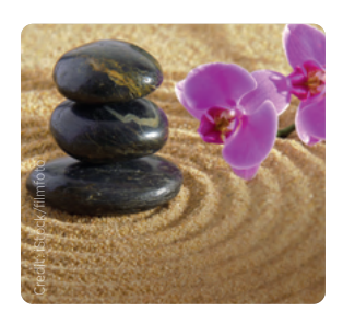
THE TAX BURDEN ON HIGH INCOME