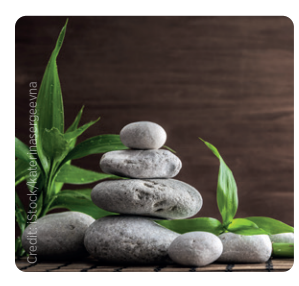
THE POWER OF YOUR PENSION

The investment option that lets you control how and where your money is invested