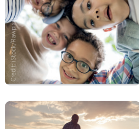
HOW INHERITANCE TAX WORKS

Making a will is the essential first step of an effective estate plan