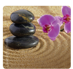
THE TAX BURDEN ON HIGH INCOME