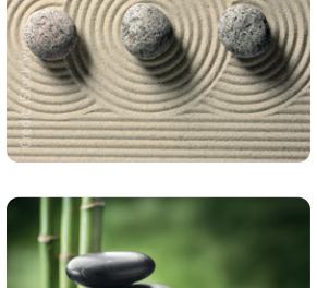
SELF-INVESTED PERSONAL PENSIONS (SIPPS)

The investment option that lets you control how and where your money is invested