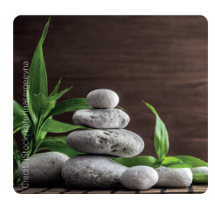
THE POWER OF YOUR PENSION

The investment option that lets you control how and where your money is invested